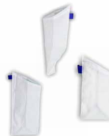
Tissue Retrieval Bags